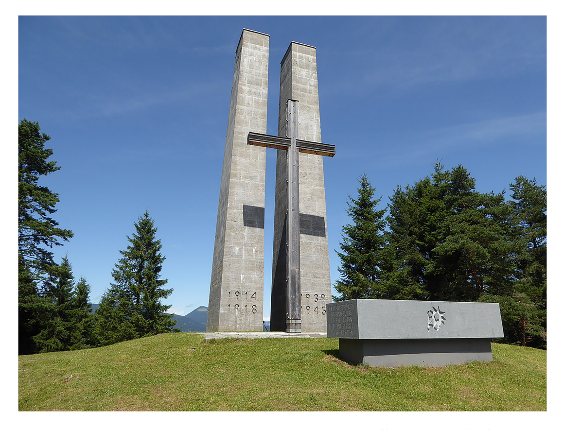
Figure 3: The fallen soldiers memorial on Hohe Brendten near Mittenwald. https://de.wikipedia.org/wiki/Datei:20170807_xl_ P1130838-ehrenmal-der-gebirgstruppe-am-hohe-brendten-bei-mittenwald.jpg.

soldiers memorial consists of a wooden cross and two masoned stelae with the wording: "1914–1918" and "1939–1945." A new element of concrete was added in 2015 to remember fallen soldiers of the Bundeswehr.