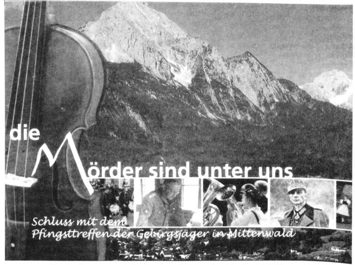
Eine bundesweit verschickte Postkarte 2004 aus dem Touristenidyll Mittenwald

Figure 9: The cover page and images taken from a brochure designed 2005 as an alternative "Tourist Guide through Mittenwald and Surroundings" with a provocative subtitle: "Asking for the Rope in the Hangman's Small Town." Besides information about the history of Mountain Soldiers and the campaign's agenda on more than 60 pages, it also contains images of 'propagation materials' from the previous year's protest. The advertised Karwendel sunscreen promises care, protection and "browning" – the common German term used for getting a tan, here playing on the brown Nazis. The postcard combining pictures of the idyllic alpine scenery and people in traditional costumes and military uniforms says "Murderers Among Us," which also refers to the German film of the same name from 1946 dealing with the Nazi past. Author's archive.