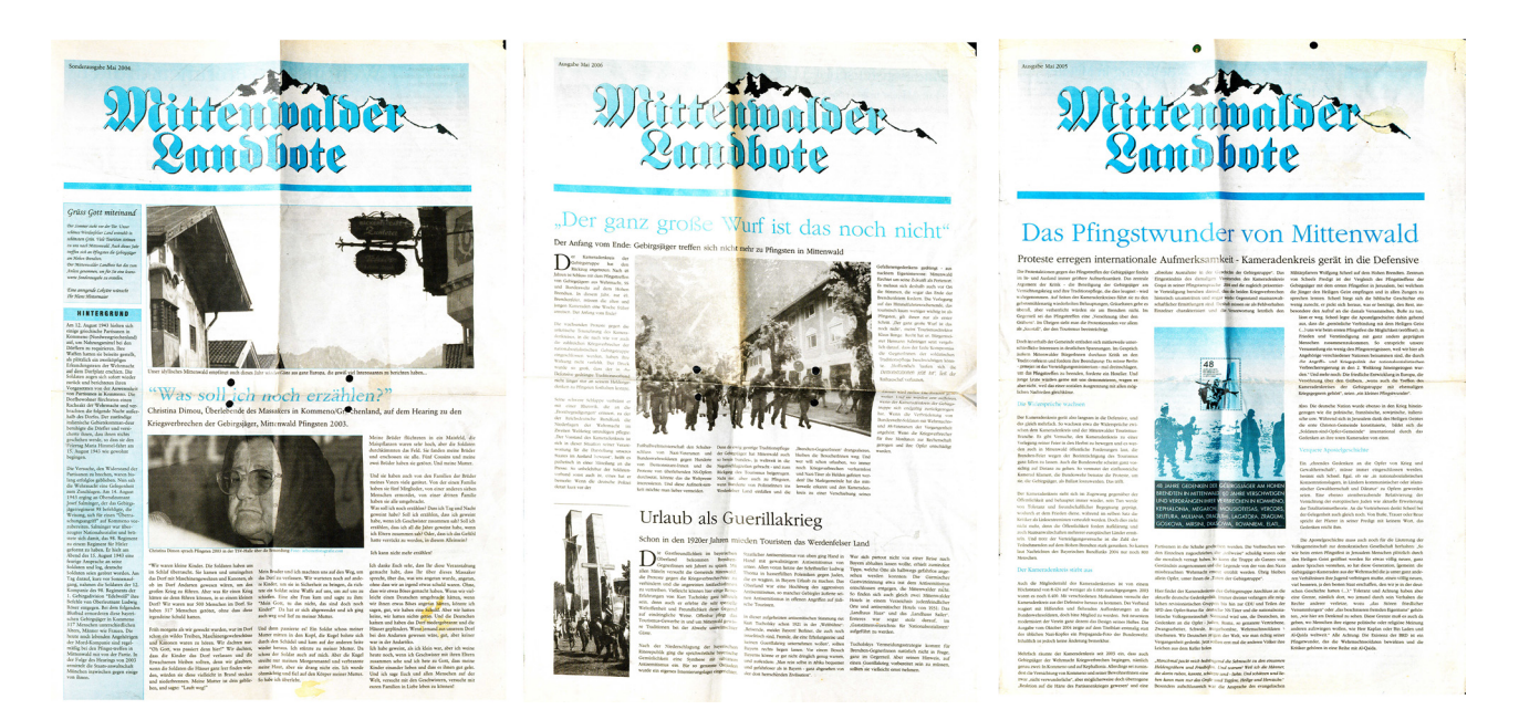
Figures 4, 5, and 6: The cover pages of activists' newspapers distributed during the protests in 2004, 2005, and 2006.

high variety of protest forms, and the flexibility with which they embedded impulses from current public discourse into their own arguments.<sup>38</sup> Additional meetings and demonstrations thus took place in front of the Bundeswehr barracks in Mittenwald, in front of a courthouse in Munich, and the homes of veterans whose investigation for committing war crimes was requested.<sup>39</sup> As a result, the Mittenwald campaign united several thematic issues, both historical and contemporary, which continuously provoked a wide set of emotions and raised the attention of journalists in Germany and abroad to their activities, goals and, not least, to the alternative historical narrative opposing the myth of a "clean Wehrmacht."