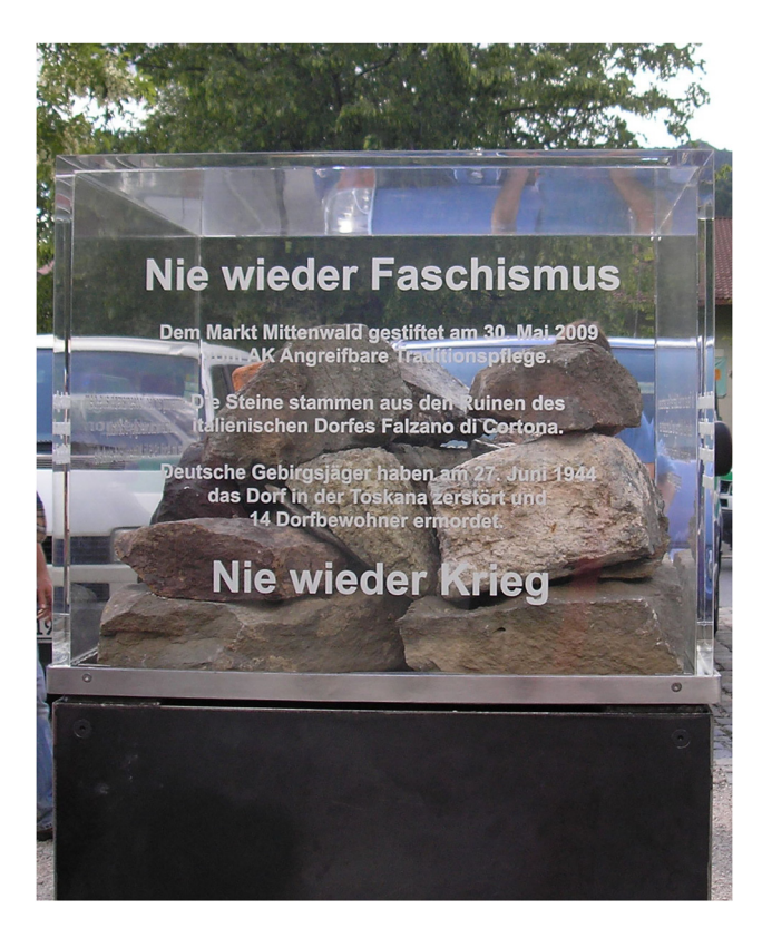
Figure 8: One of the dedications on the monument to the victims.

the time of the commemorative ceremonies, the memorial was repeatedly damaged by graffiti (2003), fire (2004), and pink paint (2009) by anonymous individuals who supported the campaign, as was evidenced by identical political slogans.