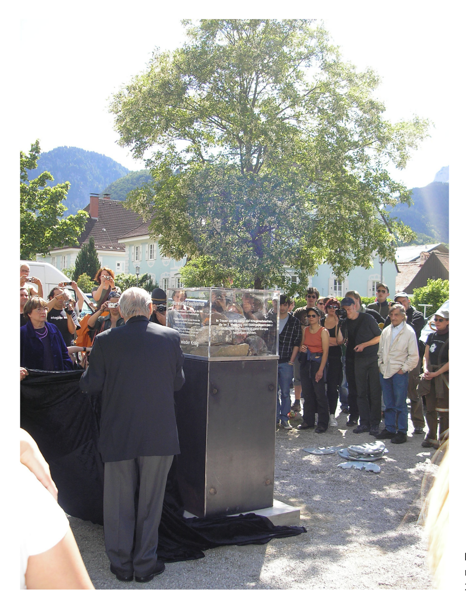
Figure 1: The illegal unveiling of the monument to the victims by campaigners in 2009.

part of the local collective remembrance at all. Thus, from the perspective of Public History, the outcome of this protest campaign could be interpreted as creating space for previously marginalized voices of victims and survivors and constructing more participatory and pluralistic historical knowledge.