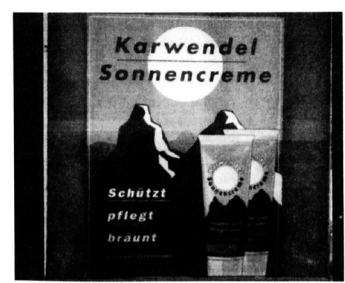
Bräunungscreme Mittenwald 2004